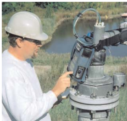
Trained technicians balance LFG system and seek ways to reduce odors

There is no “one size fits all” standardized application of odor management practices, but there are numerous effective odor prevention and control measures with a proven success record. The following techniques, alone or in the best combination for the particular site, represent a proactive approach to stopping odors before they become a problem: