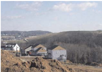
New homes being built near an existing landfill

Complaints about odors can be a frequent cause of friction with facility neighbors. Population growth and suburban sprawl may even affect facilities originally constructed in remote areas, as residential and commercial growth moves closer. While risk 1 impact studies have shown that odor is rarely an off-site health hazard, it can be a nuisance for people living or working near a facility. Odor: